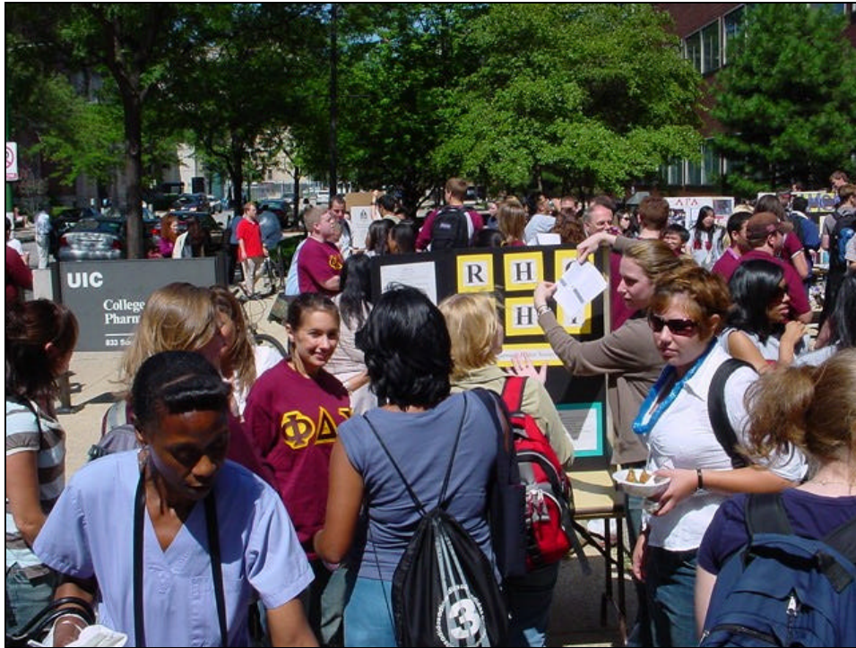
A busy Organization Day in which many College of Pharmacy Students were introduced to PDC.