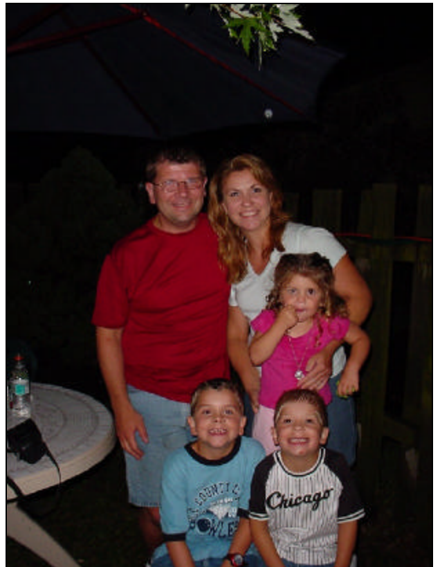
The Staron Family always present in full force!