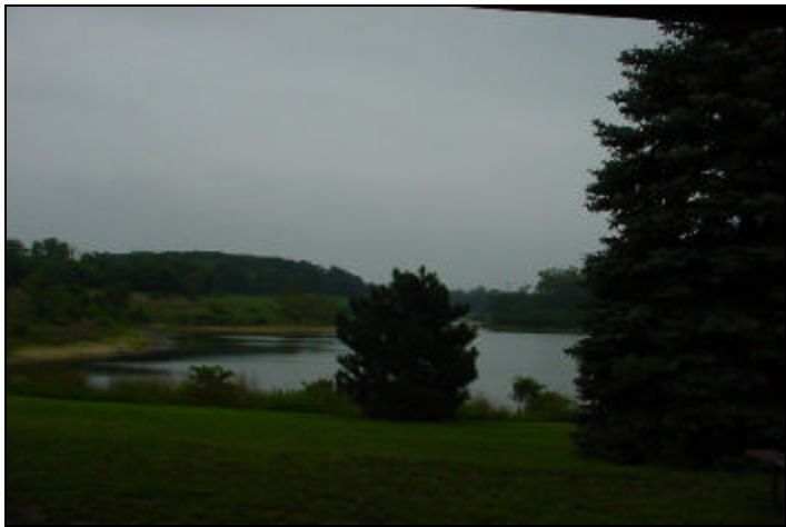
A little cloudy but still a nice August day for a retreat!