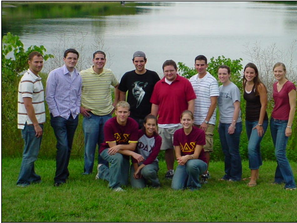
The Executive Board for the Collegiate Chapter 2006-2007.