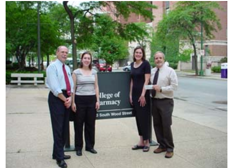
Check Presentation - Scholarship Fund 8-26-2003