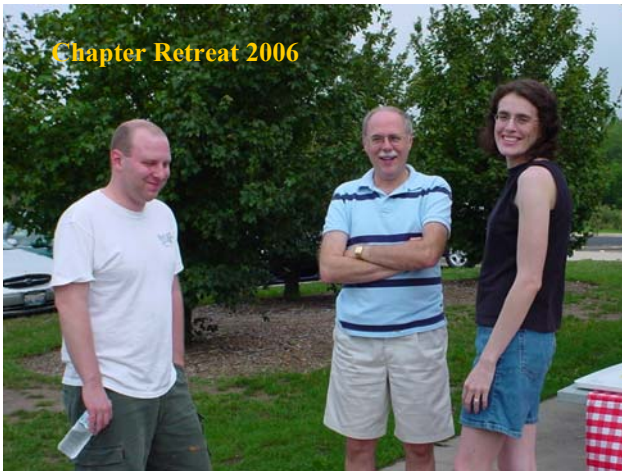
Chapter Retreat 2006