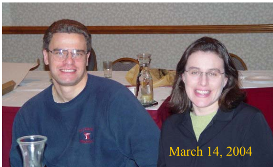
March 14, 2004