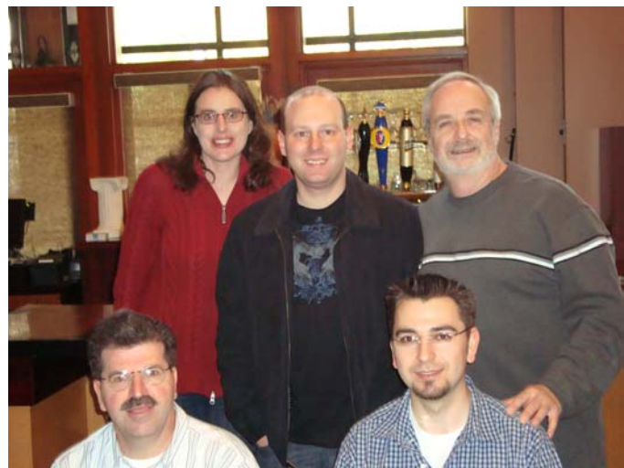
Alumni Chapter Meeting 10-19-2008