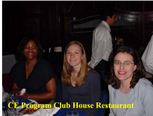
CE Program Club House Restaurant