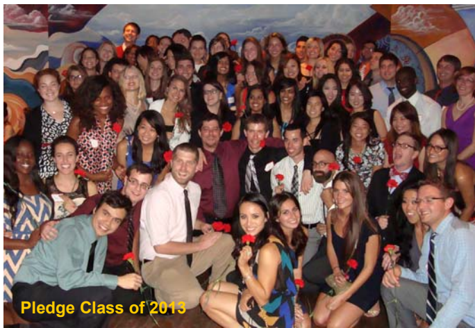
Pledge Class of 2013