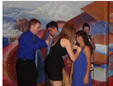
Receiving Pledge Pins