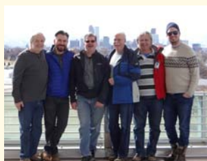
March 2017 Trip