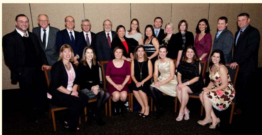
PDC Alumni at the 2012 Alumni Reunion at Harry Caray's Italian Steakhouse and Bar in Lombard, IL.