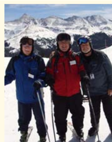
Pledge Class 1969