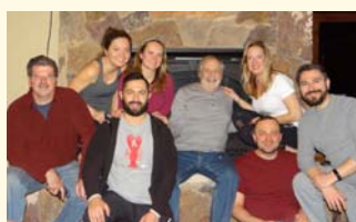
January 2017 Trip

Our small group enjoys going out west and just having a good time. We welcome all level of skiers to join us this season. The March 2018 trip dates planned are 3-3-18 to 3-10-18. We have rented a townhouse in Frisco, CO for the March 2018 trip. There are many more rentals available in Frisco and Dillon for the dates we have reserved. Our plans are to ski at Copper Mountain and at Breckenridge. Discounted lift tickets are available at Copper. If anyone is interested please email the Alumni Chapter for details at: alphasigmadc@gmail.com