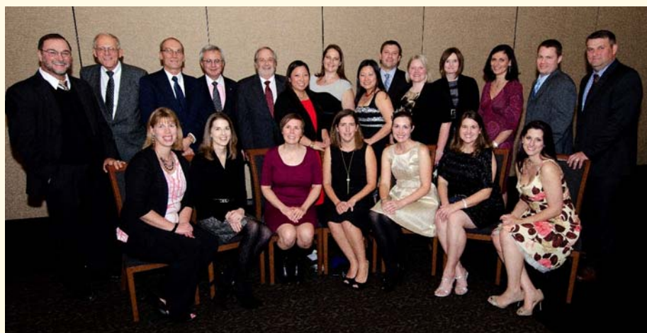
PDC Alumni at the 2012 Alumni Reunion at Harry Caray's Italian Steakhouse and Bar in Lombard, IL.

It's not too late to sign up for the event! Hope to see a great Phi Delta Chi turnout.