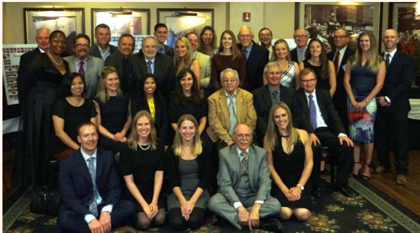
Many PDC Alumni were in attendance at this year's reunion. The 31 Brothers pictured above represented graduating classes from 1959 to 2012.