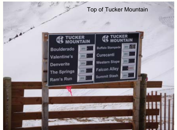
Top of Tucker Mountain