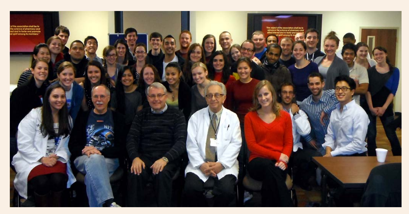
Founders' Day 2012