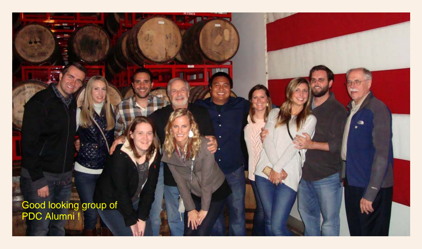
Revolution Brewery - November 2015