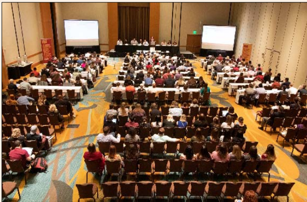
Grand Council 2019 in Anaheim, CA.

Start planning and fundraising now to attend the Ultimate Brotherhood Experience!