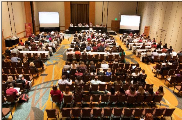
Grand Council 2019 in Anaheim, CA.

Start planning and fundraising now to attend the Ultimate Brotherhood Experience!