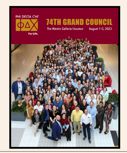
Grand Council 2023 in Houston, TX.