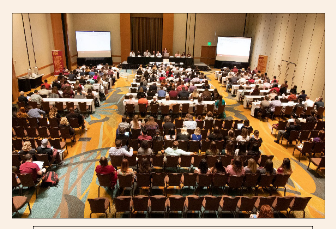
Grand Council 2019 in Anaheim, CA.

What happens at Grand Council? During Grand Council, our Chapter's Collegiate and Alumni delegates as well as Alumni Chapters will vote on business. Brothers will be able to participate in reference committees, Regional Caucuses, officer training courses, professional development opportunities, the Leader-Development Seminar (LDS) track, continuing education, and more. Start planning and fundraising now to attend the Ultimate Brotherhood Experience!