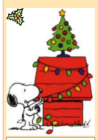
"Celebrate the happiness that friends are always giving, make every day a holiday and celebrate just living!"