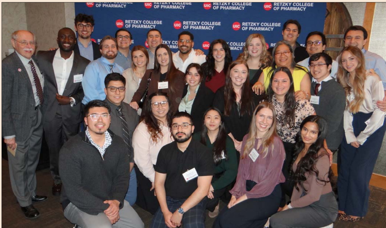
Some of the recipients are not pictured