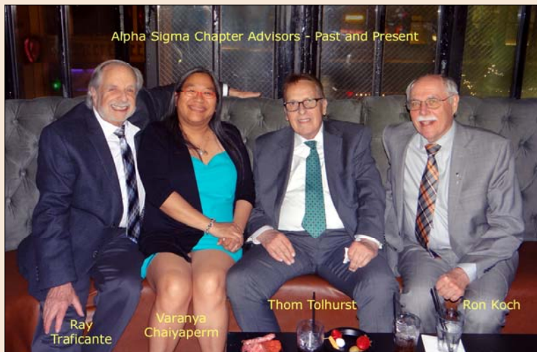
Alpha Sigma Chapter Advisors - Past and Present