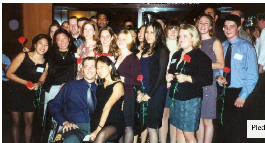
Pledge Class 2000