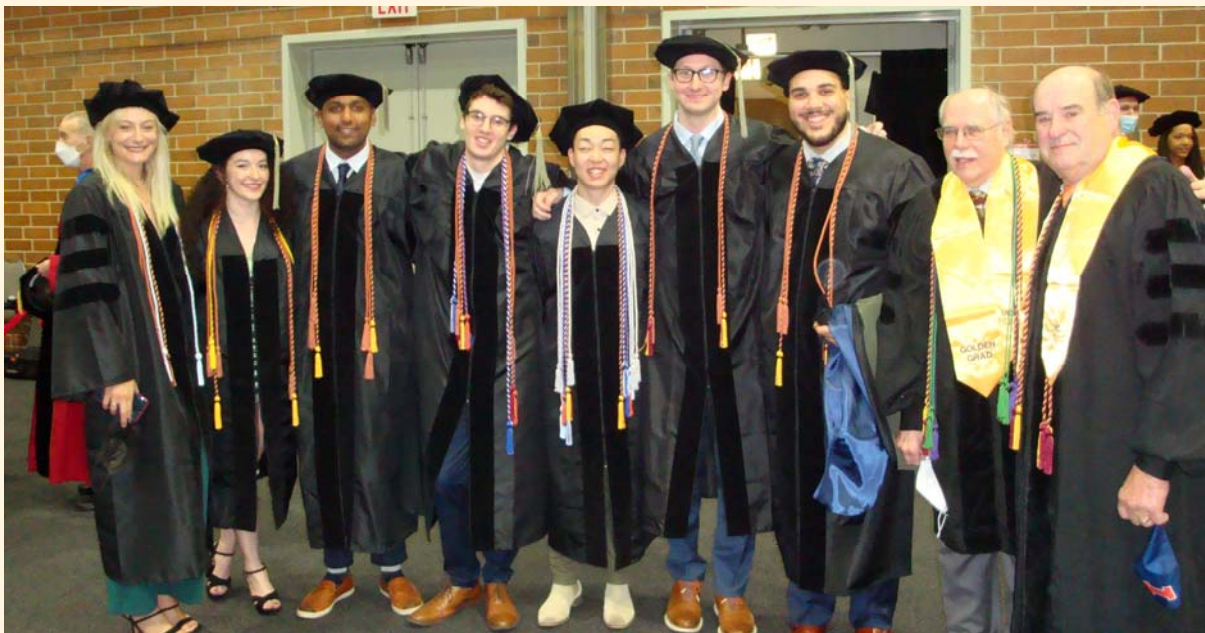
Phi Delta Chi Graduates (New & Old)