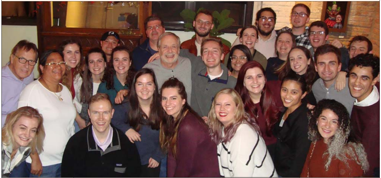
Lo Rez Brewery - November 2019 Catered by El Milagro Restaurant