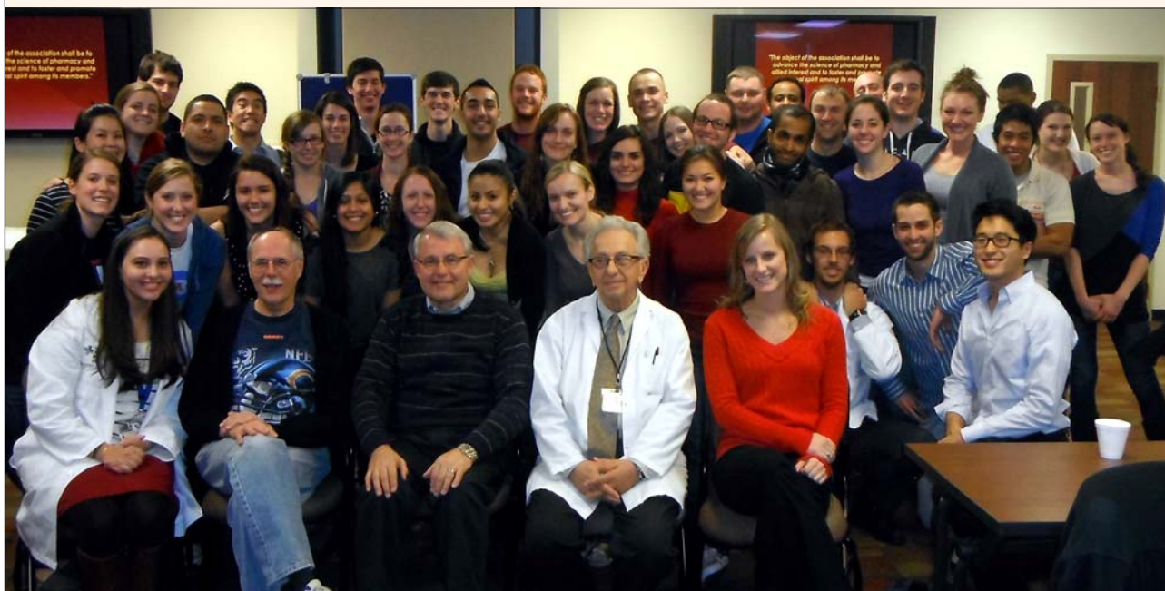
Founders' Day 2012