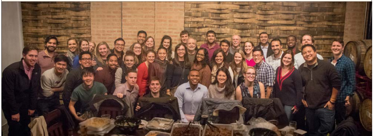
On Tour Brewery - 2017 (Catered by Blackwood BBQ)