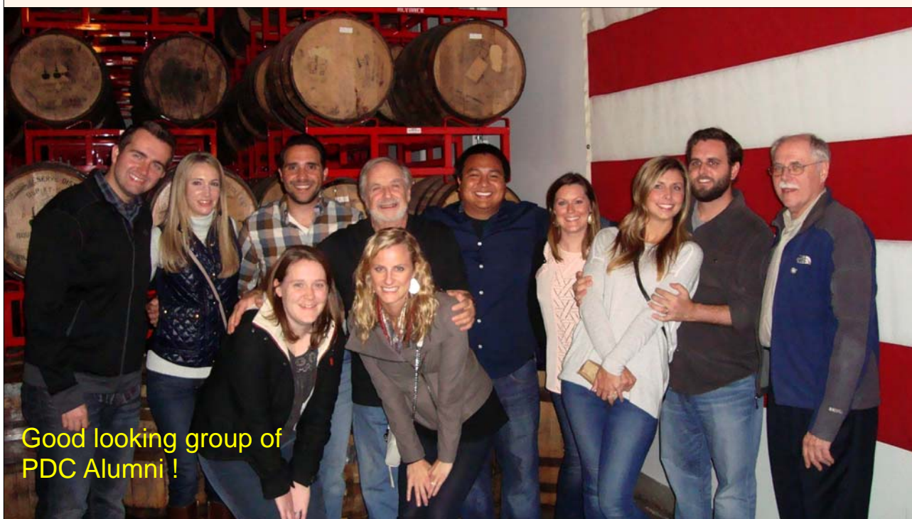
Good looking group of PDC Alumni !