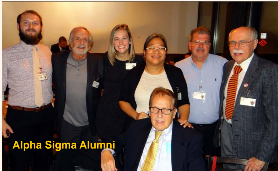
Alpha Sigma Alumni