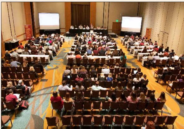
Grand Council 2019 in Anaheim, CA.

Start planning and fundraising now to attend the Ultimate Brotherhood Experience!