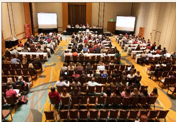
Grand Council 2019 in Anaheim, CA.

Start planning and fundraising now to attend the Ultimate Brotherhood Experience!