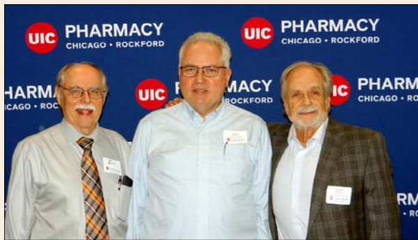
Alumni Brothers Presenting Scholarships