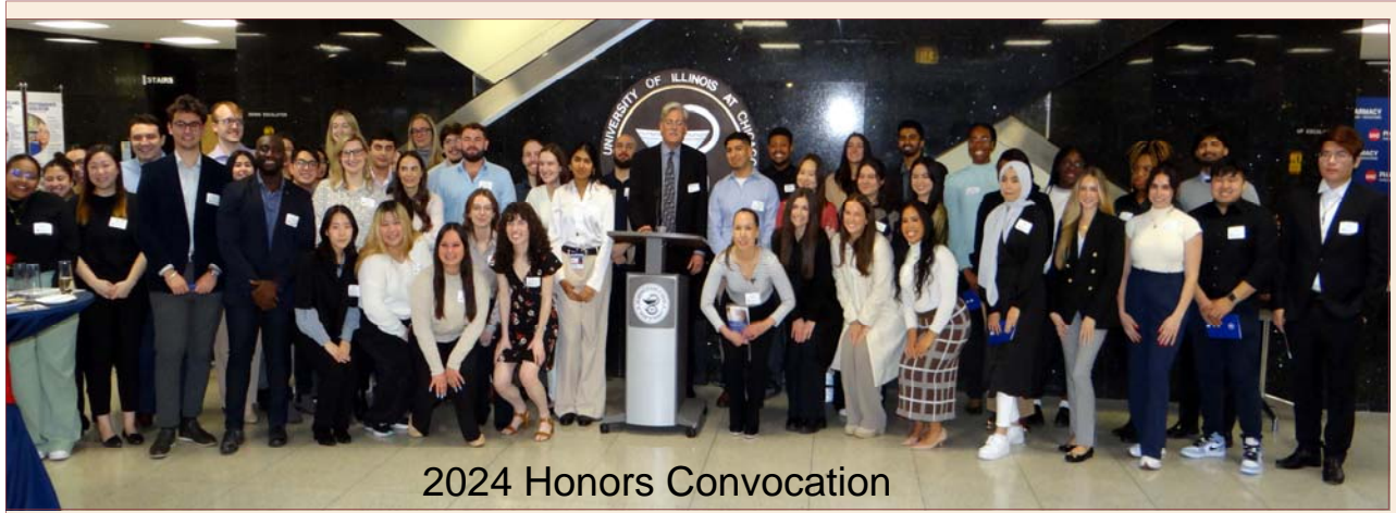
2024 Honors Convocation