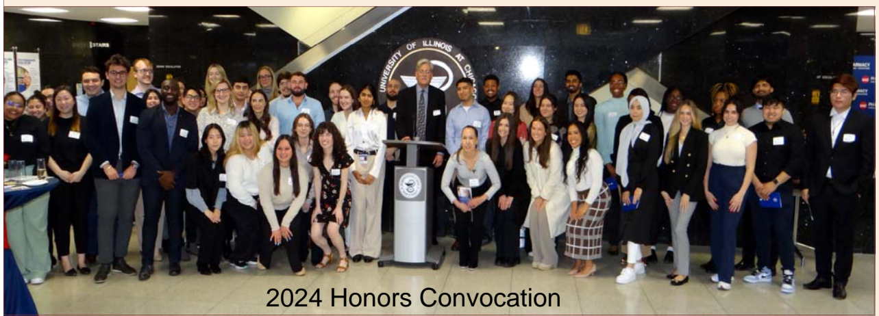
2024 Honors Convocation