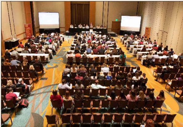
Grand Council 2019 in Anaheim, CA.

Start planning and fundraising now to attend the Ultimate Brotherhood Experience!