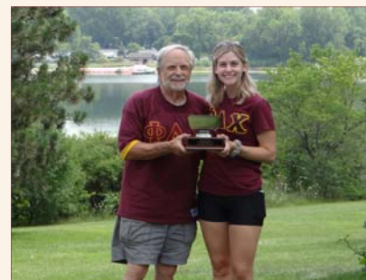
Photos taken at the 2023 Retreat