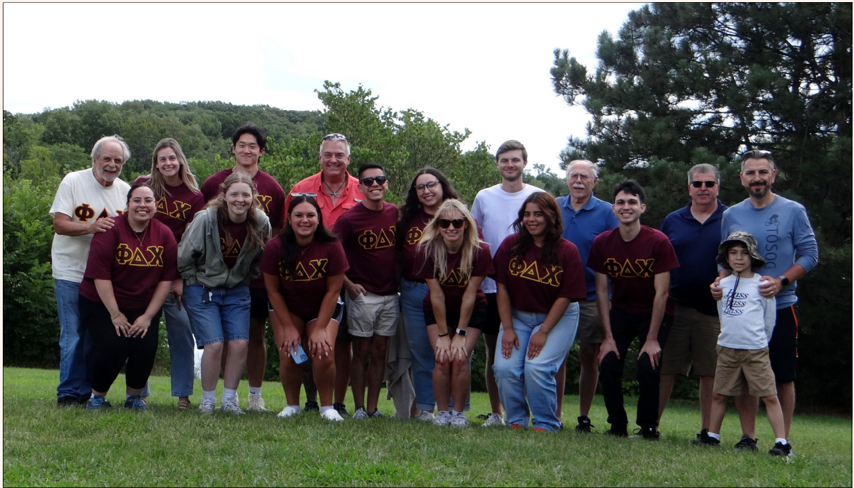
Alumni and Collegiate Brothers August 24th, 2025